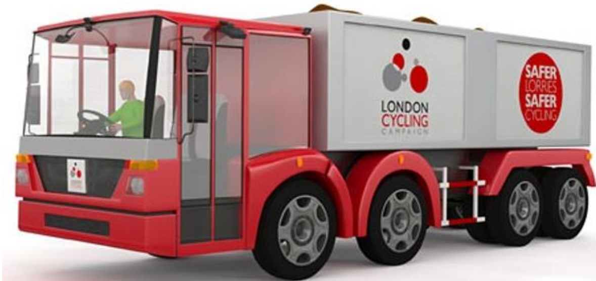
Proposal to increase visibility