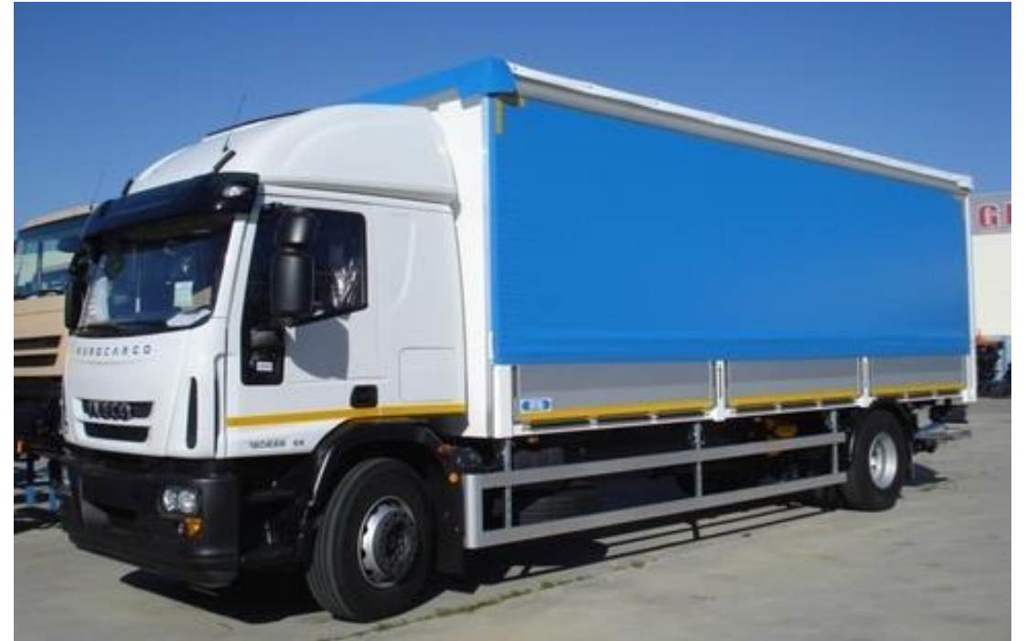
Example of side underrun protection