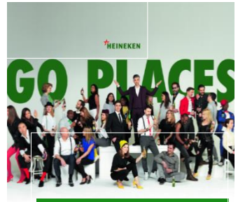
People are at the heart of our company.