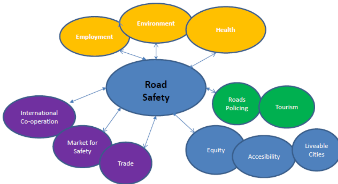
Figure 1 Integration of Road Safety into Different Policy Areas.

The main benefit of integrating road safety into other policy areas is that there is added strength in achieving joint objectives due to synergies. For example if one policy area wishes to bring about a new measure and it discovers that in doing so it will also reach an objective in another policy area this may