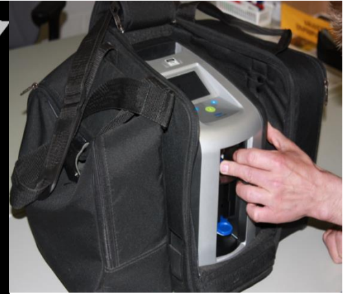
Dräger 5000 Drug test 7 devices