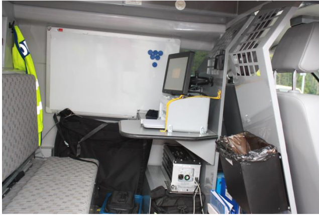
Evidenzer 240 mobile in patrolcar 50 devices