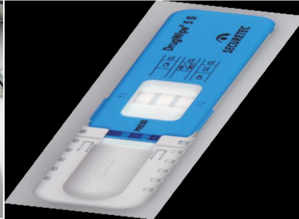
DrugWipe 6 S