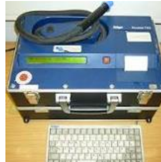
Dräger 100 devices in police stations