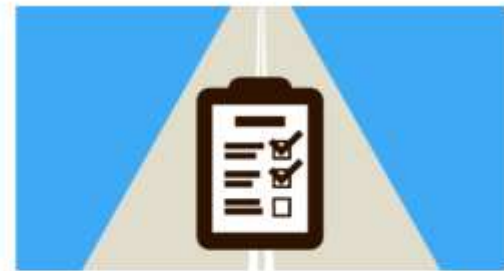
Hello safety expert

Do you want to be on top of the work place risk you are responsible for? This guide gives you an overview of cost efficient good practice to act on vehicle related risks, to